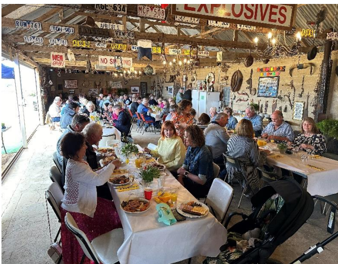
Enjoying breakfast at the tables