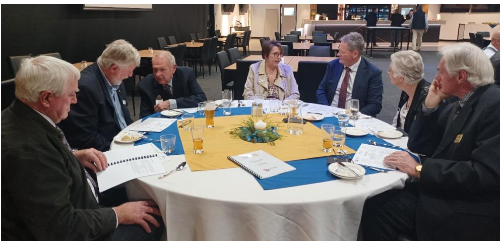
A table of guests from Rotary Clubs at Renmark, Waikerie and Berri joined our members and the Mayor